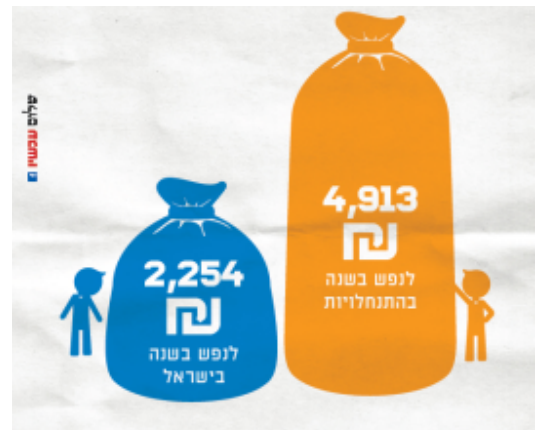
Government contribution to local authorities per capita settlements vs. Israel

The contribution of all ministries to the settlements is NIS 4,862 per capita; in Israel it is NIS 2,312.